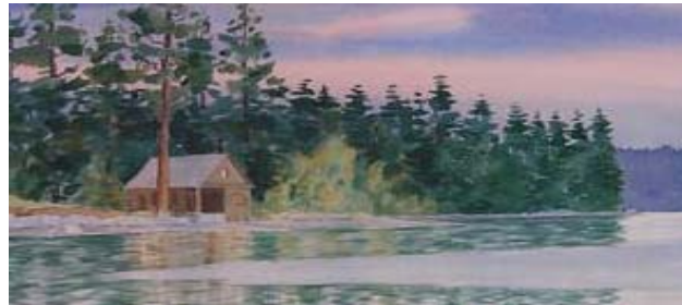
Sugar Pine Point Boathouse,

Both the south and north boat houses are open! Skilled captains are on hand to tell you all about the Cherokee , Mercury , and historic boating on the Lake. Special screenings of vintage film featuring Mercury will be shown at the SOUTH boathouse and featuring the Lake Tahoe boating will be shown at the NORTH boathouse.